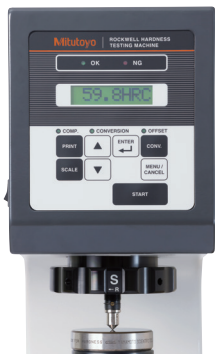
HR-320MS, HR-430MR, HR-430MS Interface