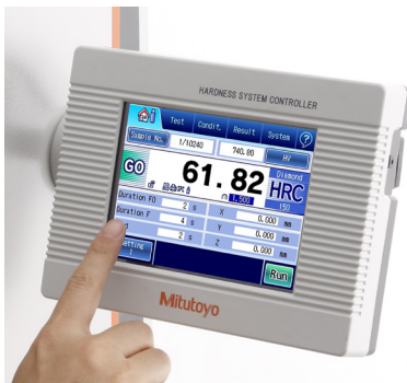
HR-530, HR-530L, HR-610A & HR-620A Touchscreen Controller