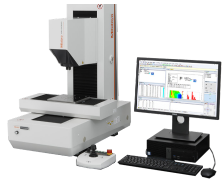
HR-620B PC Interface, Utilizing AVPAK Software